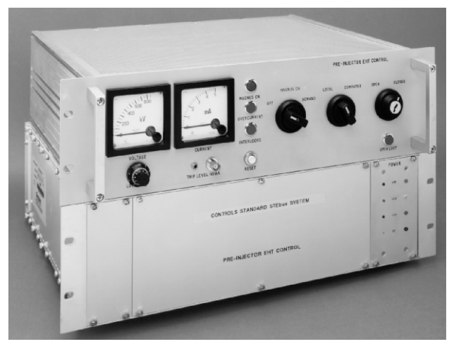
Fig. 2: Controller and STEbus Crate