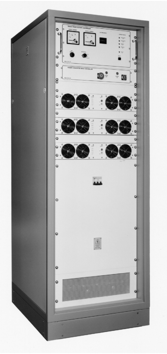
Fig. 1: Frequency Converter

With full beam intensity, the current required at -665kV is 2.2mA. The actual load on the frequency converter at full beam intensity is 61A at 69V rms giving 4.21kW which can easily be met by only two output Power Modules. Although no failure has yet occurred, a faulty output module could be removed for repairs while allowing continued operation of the converter.